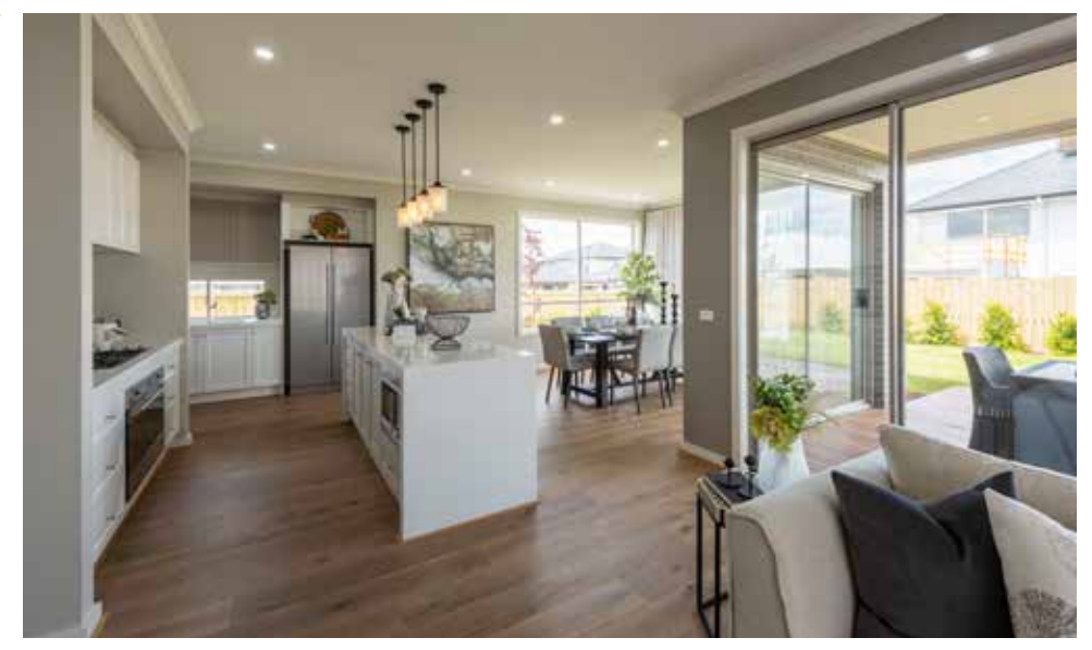
Photo is for illustrative purposes only and does not depict the home for sale. This image contains internal or external luxury upgrade items and furniture not included in the home price.