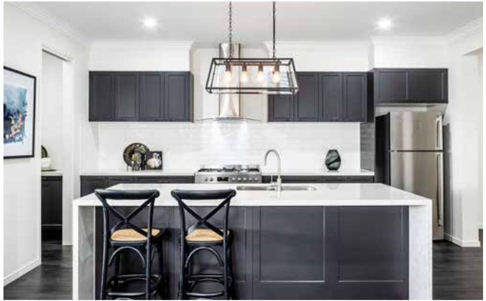
This image contains internal or external luxury upgrade items and furniture not included in the home price.