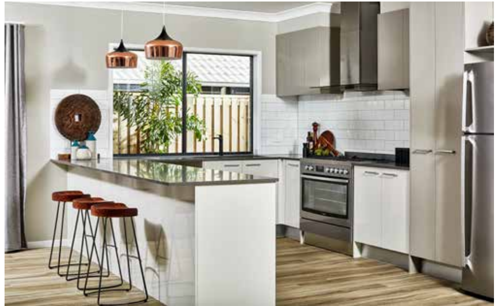
This image contains internal or external luxury upgrade items and furniture not included in the home price.