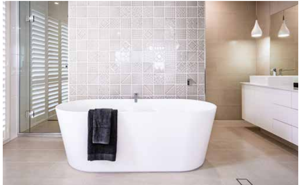
This image contains internal or external luxury upgrade items and furniture not included in the home price.