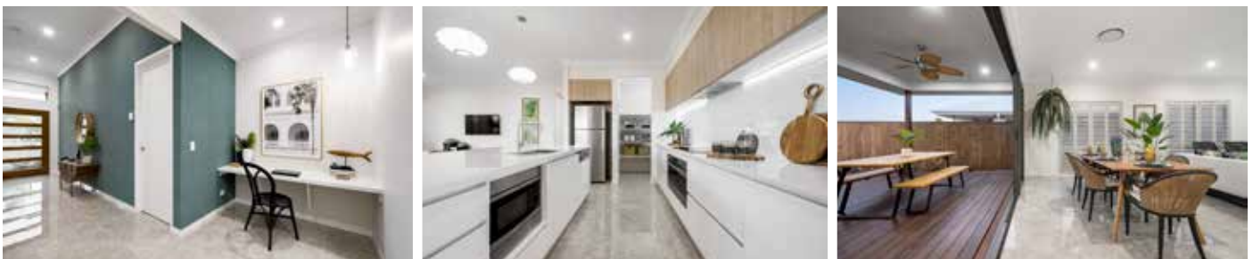
Photos are of home for sale but may contain finishes and furniture not available in the listed price.