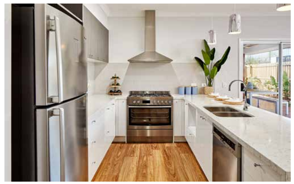
This image contains internal or external luxury upgrade items and furniture not included in the home price.