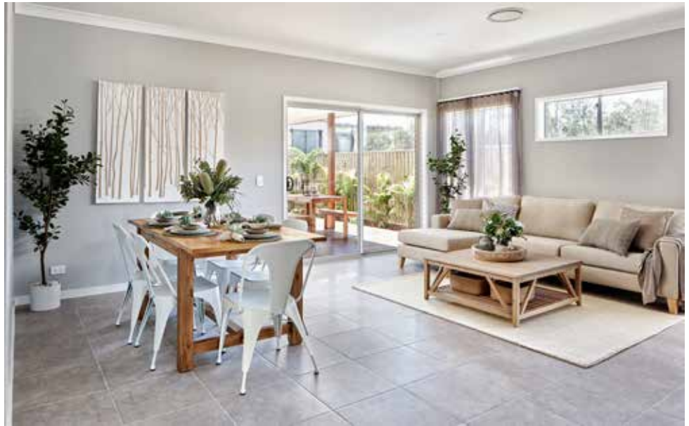
This image contains internal or external luxury upgrade items and furniture not included in the home price.