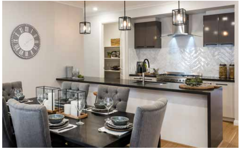
All images contain internal or external luxury upgrade items and furniture not included in the home price.