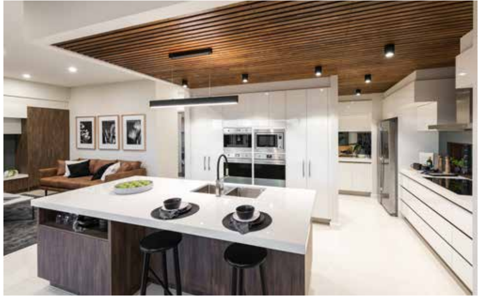
This image contains internal or external luxury upgrade items and furniture not included in the home price.