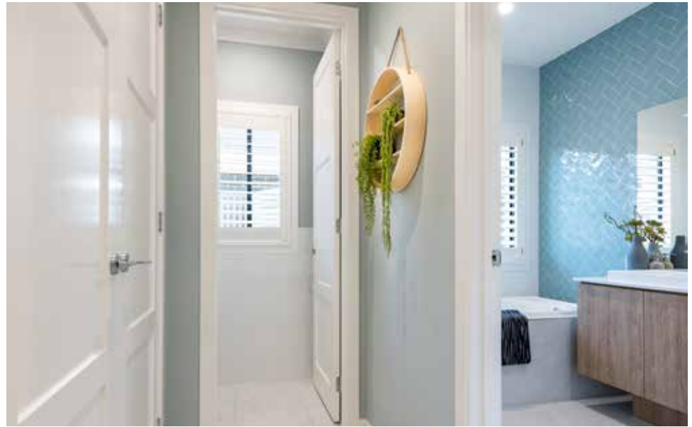
All images contain internal or external luxury upgrade items and furniture not included in the home price.