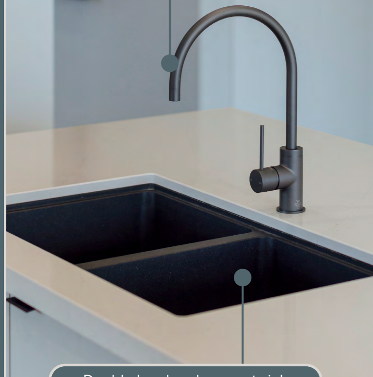
Double bowl undermount sink