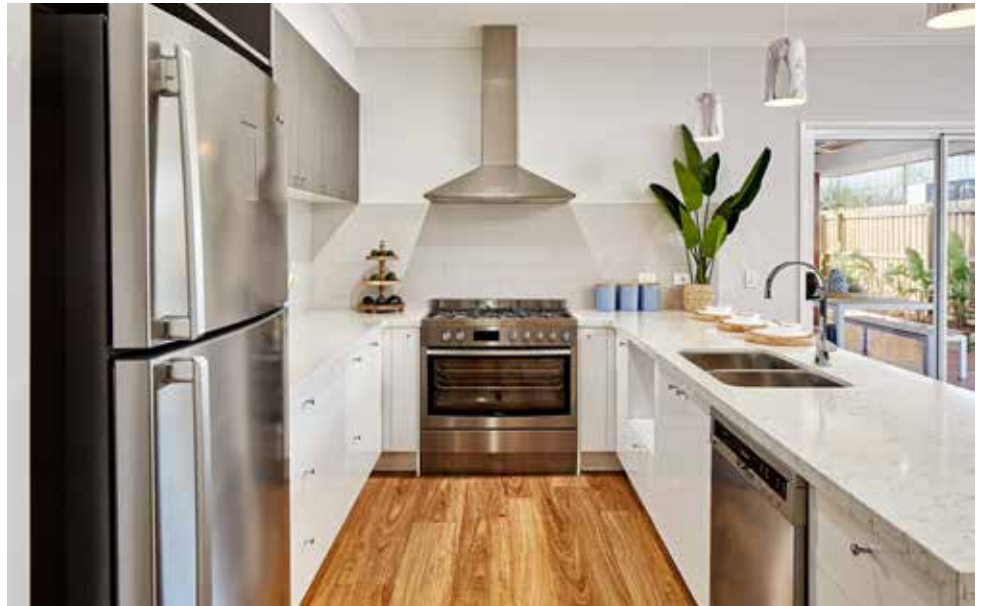
This image contains internal or external luxury upgrade items and furniture not included in the home price.