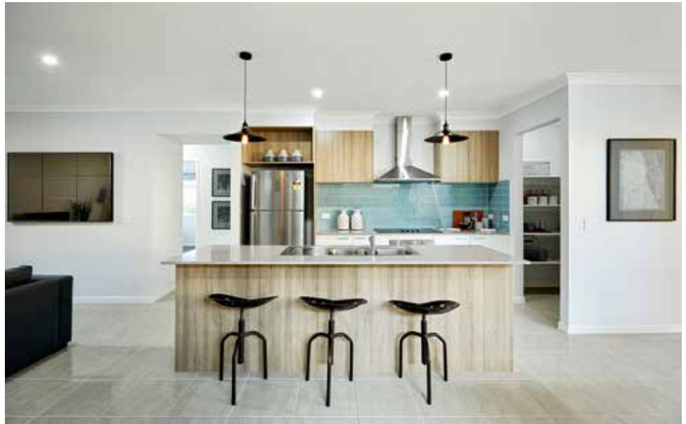
This image contains internal or external luxury upgrade items and furniture not included in the home price.