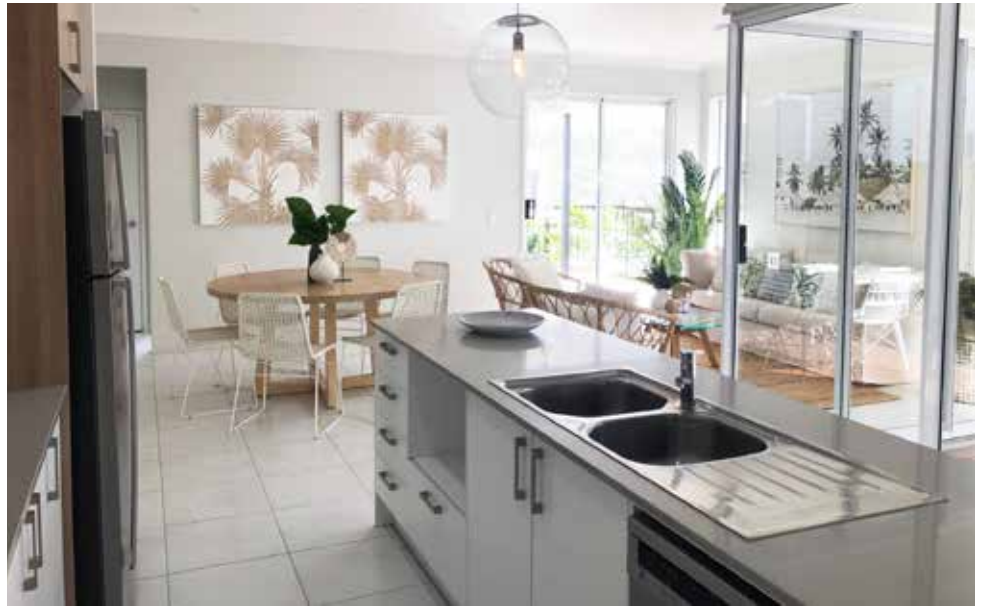
This image contains internal or external luxury upgrade items and furniture not included in the home price.