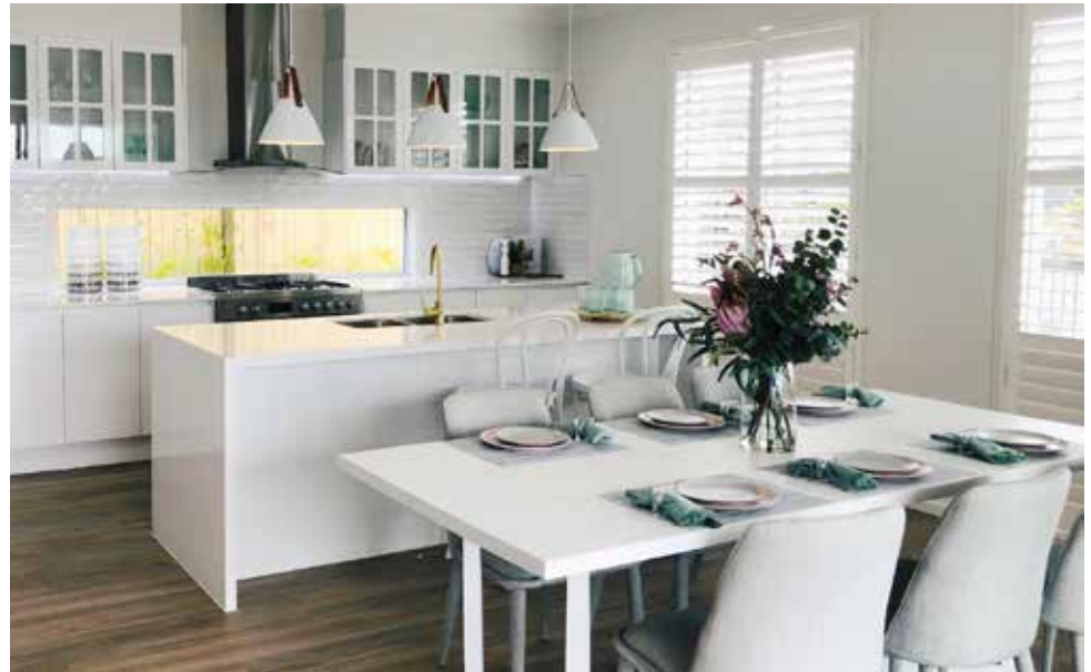
This image contains internal or external luxury upgrade items and furniture not included in the home price.