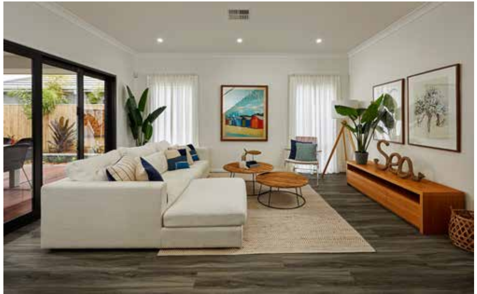
This image contains internal or external luxury upgrade items and furniture not included in the home price.