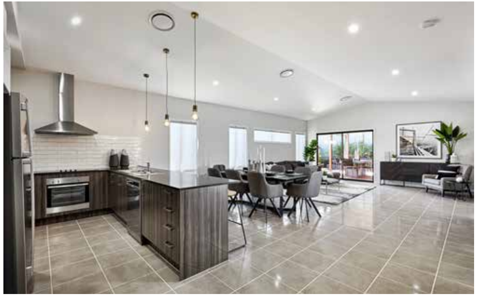
This image contains internal or external luxury upgrade items and furniture not included in the home price.